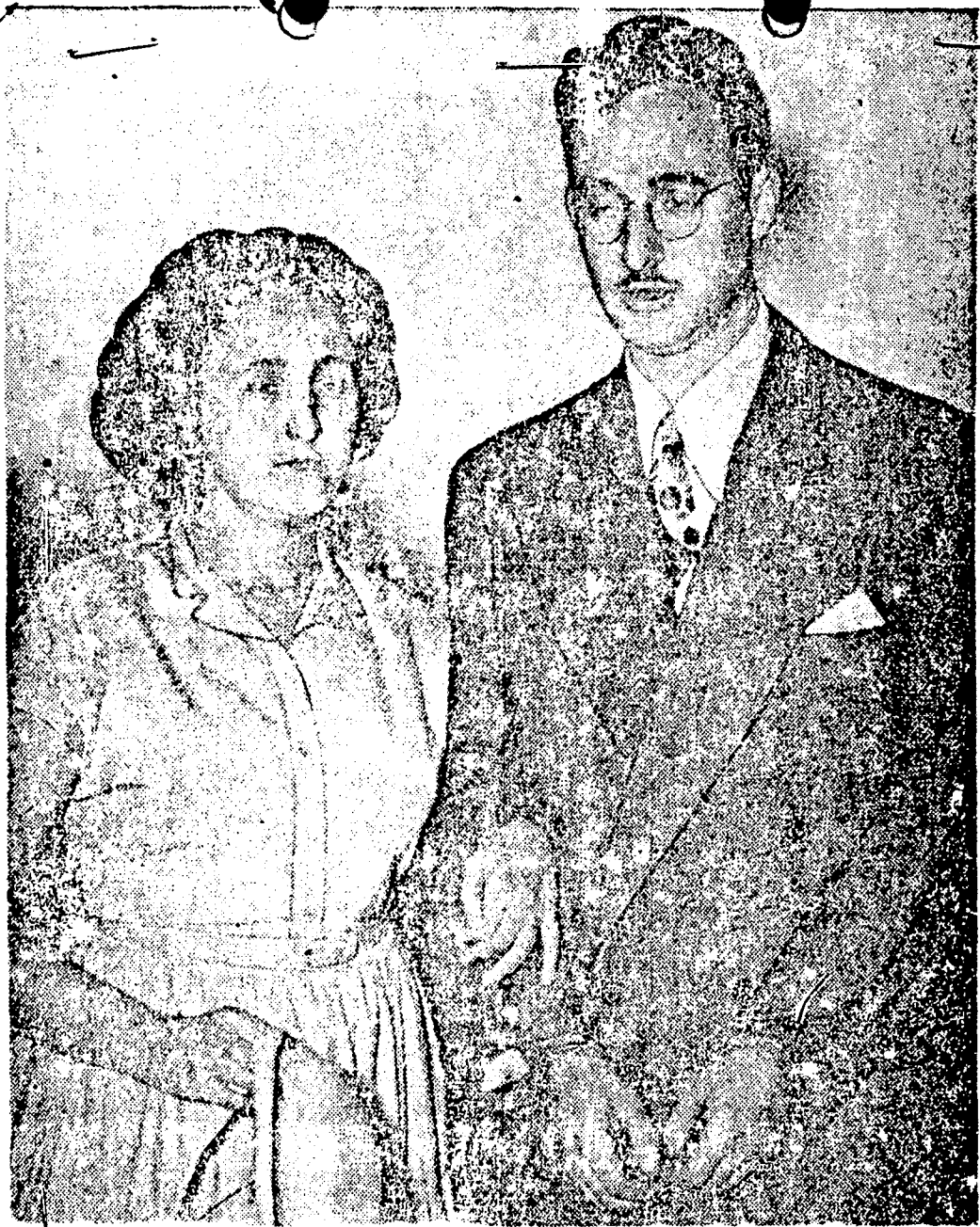
DOOMED PAIR . . . Pictured at the time of their trial as Communist atom bomb spies are Mr. and Mrs. Julius Rosenberg, whose convictions were affirmed today by the Circuit Court of Appeals. The court also upheld the death sentence imposed on the couple now in Sing Sing's death house.